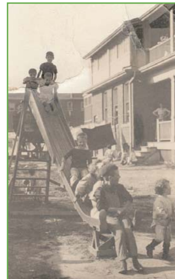
Children playing in front of the original building for Earls court circa 1932