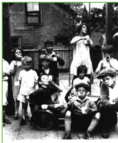
The children of The Crèche circa 1925

Child Development Institute has been engaged in a lively strategic planning process since June of this year. The goal has been to develop a plan that sets out a vision for Child Development Institute over the next three to five years and strategies for how to get there. Our strategic plan will help us to set priorities and ensure that we are staying on course to meet our objectives.